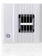
Humidity Sensitive Extract Unit