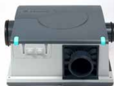
Constant Pressure Fan